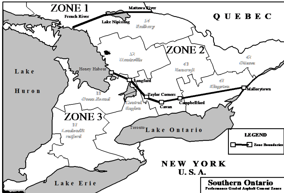
Figure 1: PGAC Zones for Ontario

The zones were delineated on the basis of temperature contours from available weather data, and with due regard for the relationship between pavement and air temperatures as established by the Long Term Pavement Performance (LTPP) studies. Table 1 provides the basic performance grades for each Ontario zone. Note that MTO currently specifies % binder replacement and therefore grades are only provided for 0 to 20 % binder replacement. If the contractor is permitted and chooses to modify the composition of the mix by including more recycled content, MTO LS-307 specifies how grade selection is also modified.