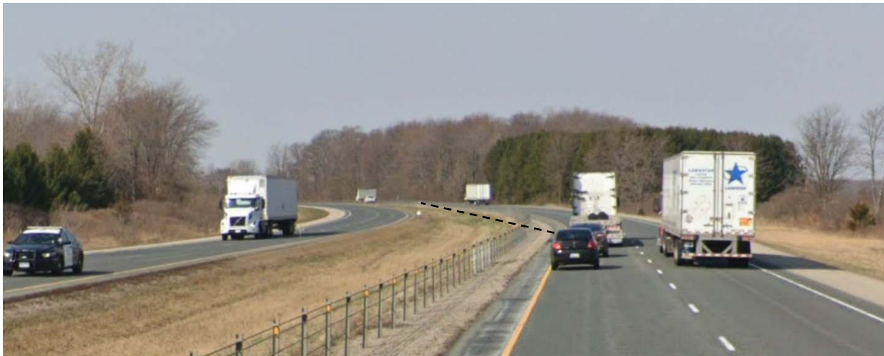
Figure 1: Effect of median barrier on sight lines around curves

Stopping sight distances and sight lines should be considered in design. Barrier system posts may affect sight lines around curves. Figure 1 shows the effect of high tension cable guide rail with respect to sight lines on Highway 401 west of London. The Highway Design Office should be consulted if there are concerns with respect to sight lines as simply increasing the shoulder width may introduce other issues.